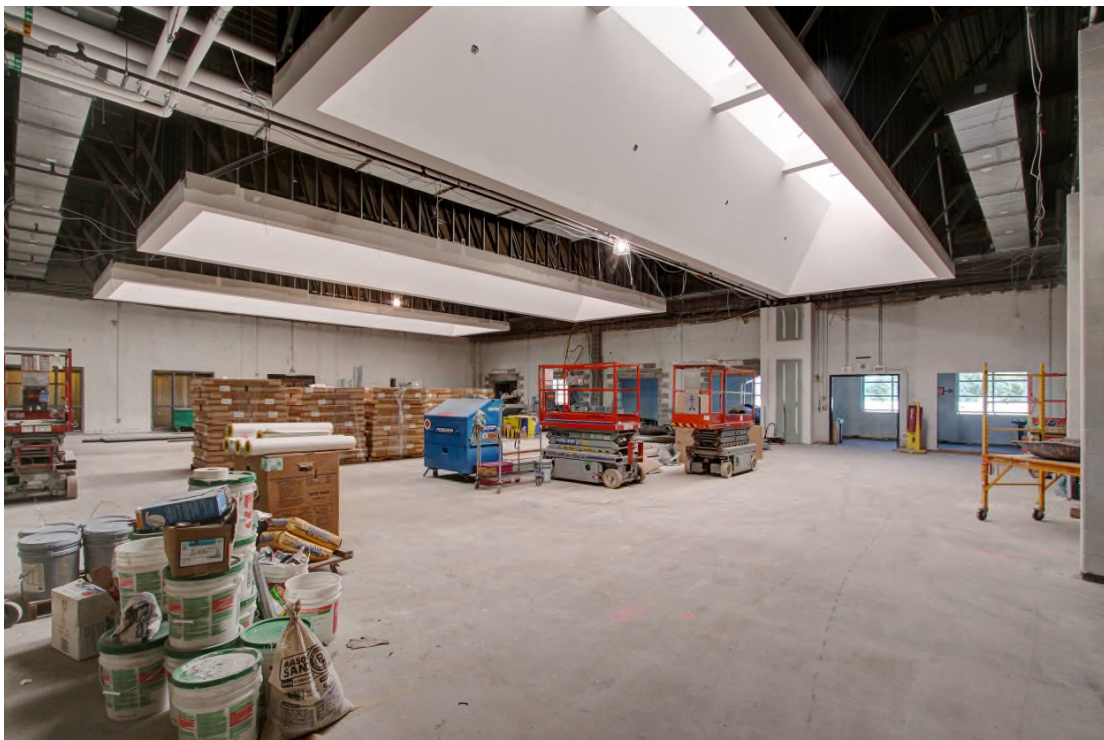
A view looking across the cafeteria from the southwest to towards the northeast shows the new windows beyond in the hallway.