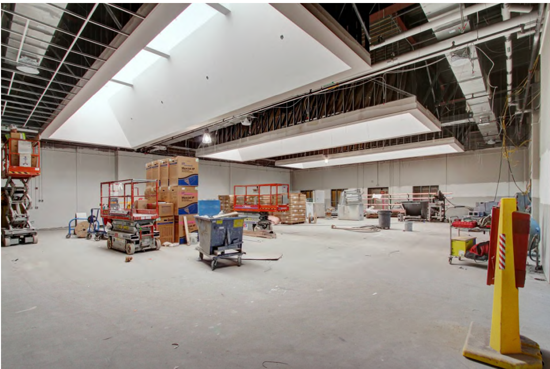
A view of the cafeteria as ceiling grid begins to fill in between the large skylight wells. The grid is beginning at the south (left edge of photo) and working north.