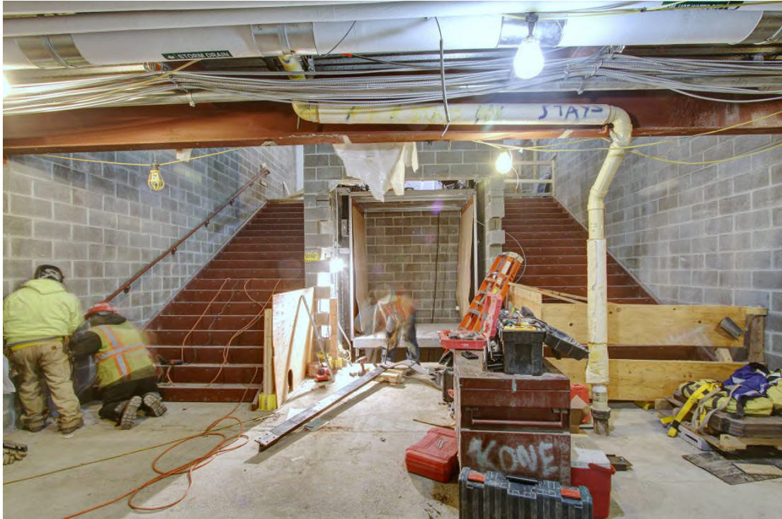
Ironworkers install handrails on the new stairs in the former Upbeat area. The new elevator is also being installed.