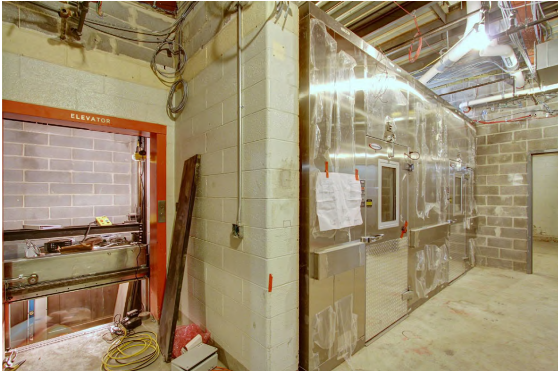
The new walk-in freezer and refrigerator are installed in the kitchen and the elevator that services the kitchen is being modernized.