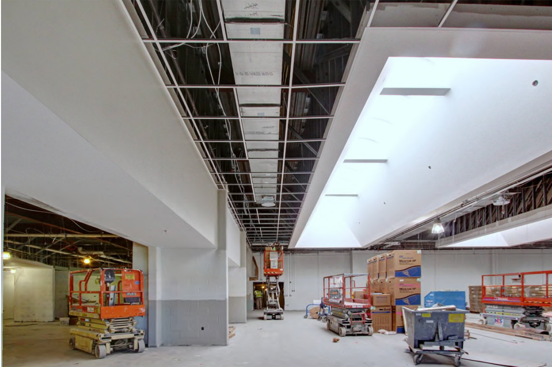
A straight on view of the new high ceiling grid being installed in the cafeteria between the perimeter walls and the large skylight wells.