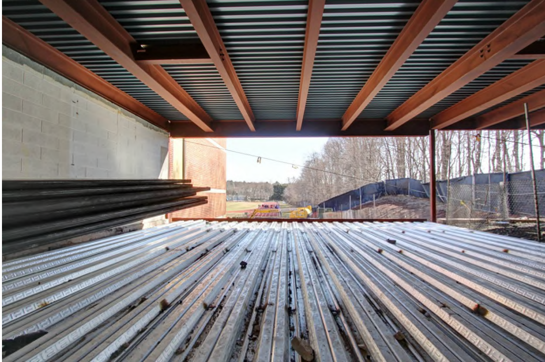
A section of new steel deck above and below form the start of the floor and roof of the new Biology CLAB looking south towards the track.