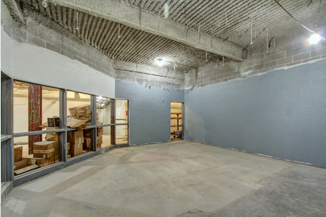
The eating area of the Family & Consumer Science space is pictured with its angled wall with windows to allow in plenty of light.