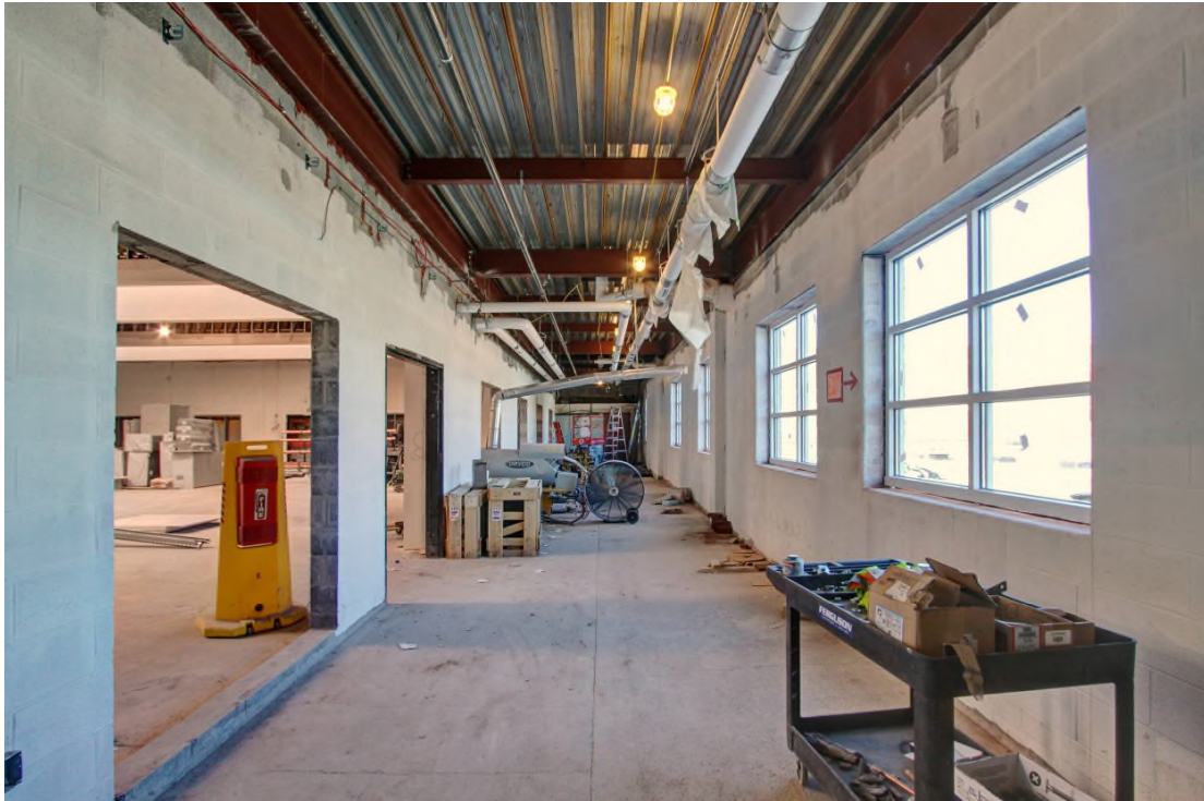
The new window frames are set and the glass installed in the corridor opposite the cafeteria. There will be new windows in most of the openings on the left also.