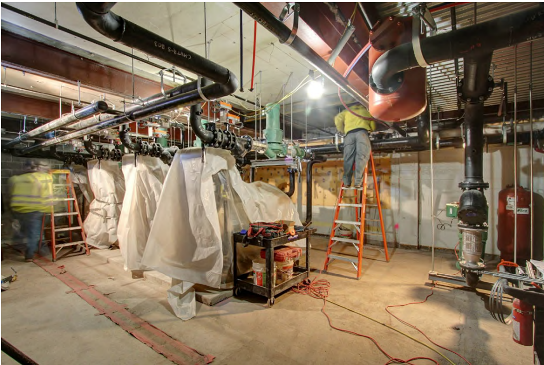
The boiler room continues to progress and will be followed next by the chiller room.