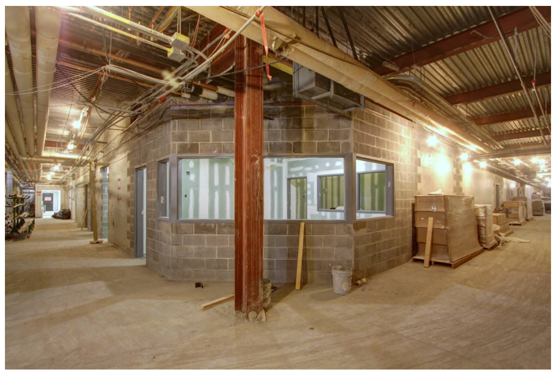
The radio station walls are complete and ready for primer and final paint. Friday, February 21, 2014