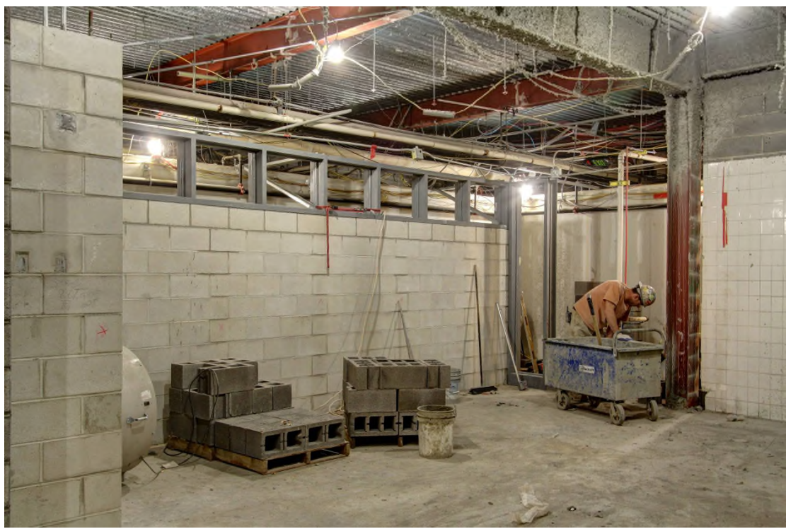
Another view from inside one of the new social studies classrooms shows a "borrowed light" frame that runs the entire length of the top of the wall to allow light into the classroom from the corridor.