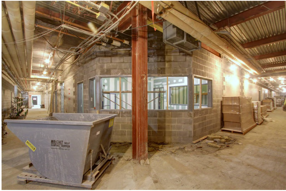
The radio station continues to develop as the masonry walls are run up to the structure above and the drywall inside is finish taped in preparation for painting. Wednesday, February 19, 2014