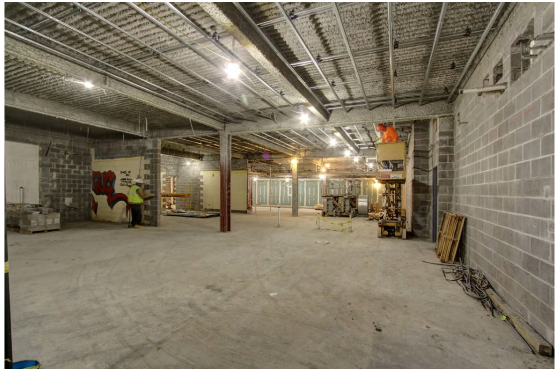
This photo is taken in the new Family & Consumer Science area with the acoustical isolation ceiling grid being installed. This hard ceiling is intended to dampen sounds of basket balls and running feed from the gym above.