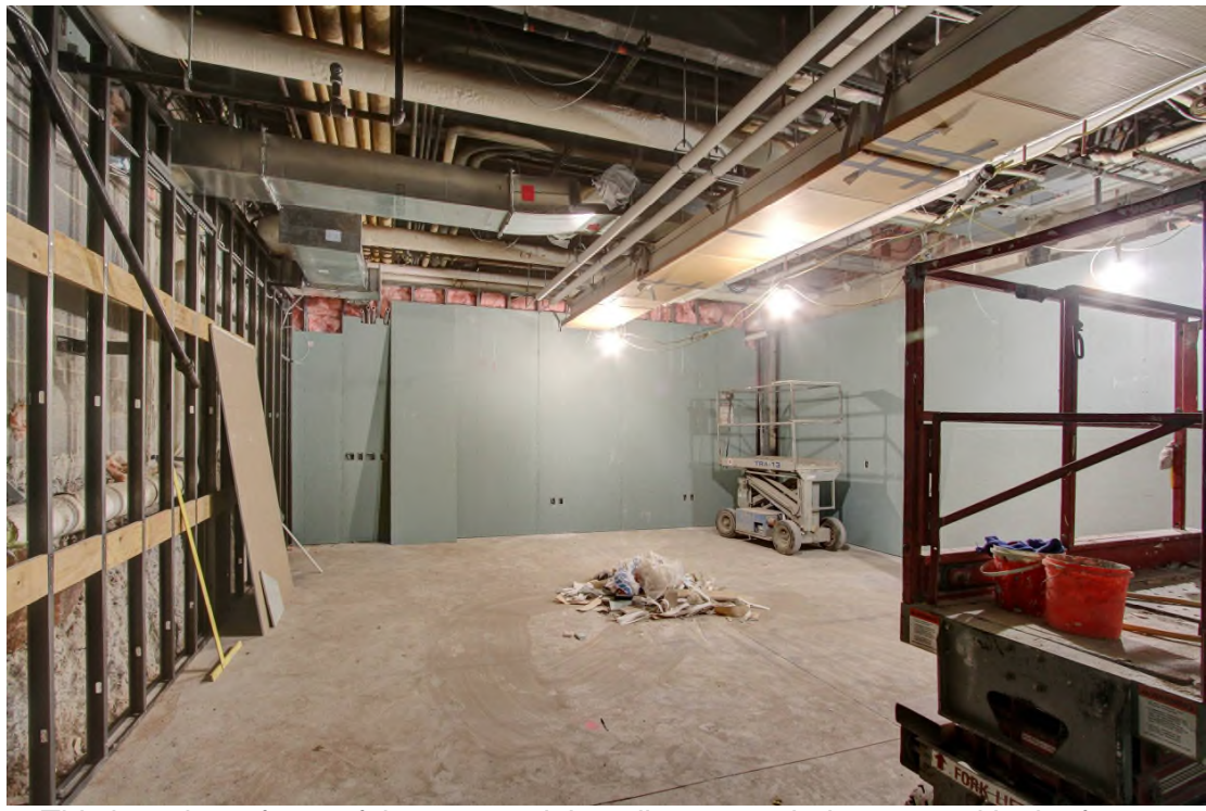
This is a view of one of the new social studies rooms being created in the former raised storage area. The overhead rough-in is complete and the walls are being clad with metal studs and sheetrock.