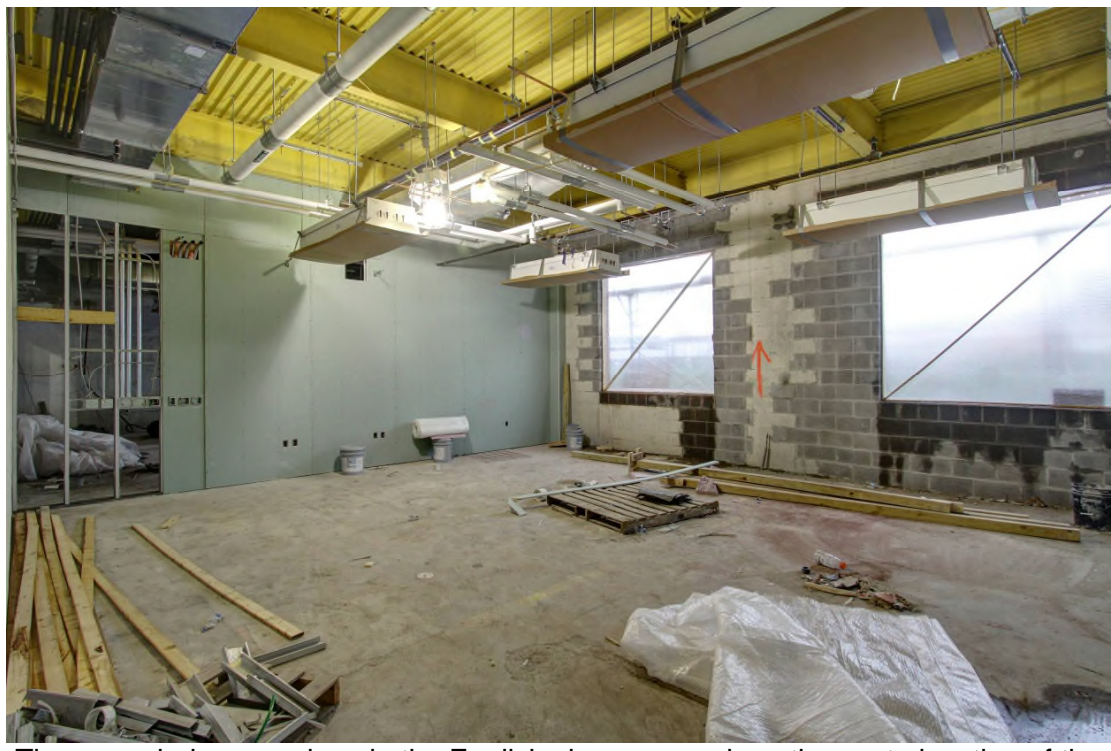
The new window openings in the English classrooms along the east elevation of the former auto shop are completed and filled with a temporary plastic enclosure pending installation of the aluminum window frame and glass.