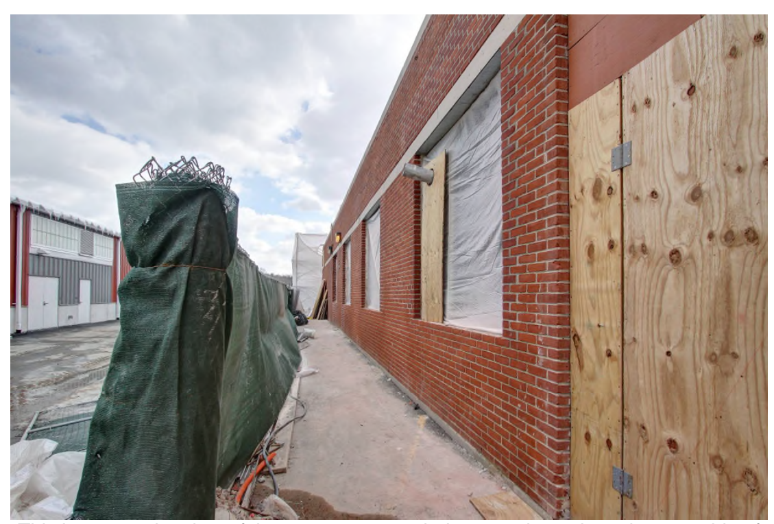
This is an exterior view of the new masonry window openings along the east side of the former auto shop now that the masonry is washed down.