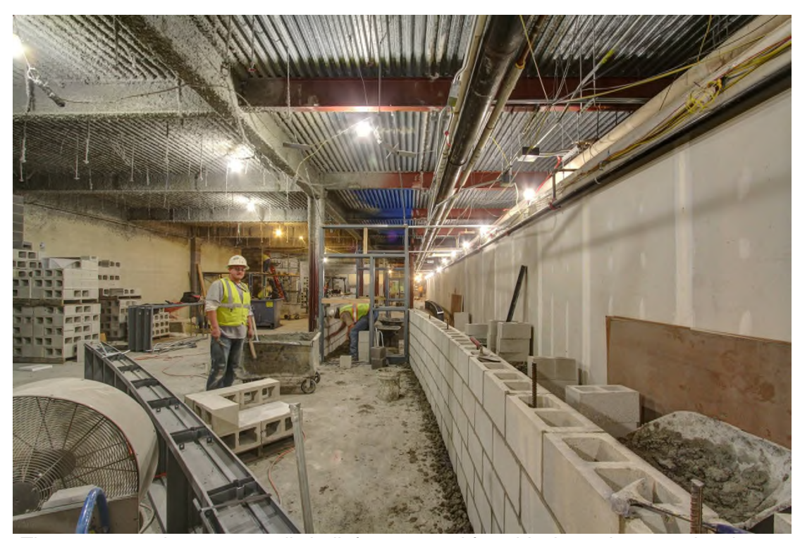
The new curved masonry walls built from ground face block continue to take shape. These walls will form the separation between new social studies classrooms and the corridor where the new light-well will be cut into the floor above.