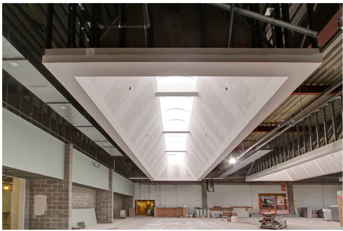
A close-up view of one of the new skylight wells as it is taped in preparation for painting. The other two skylights are to the right and the kitchen and servery are to the left.