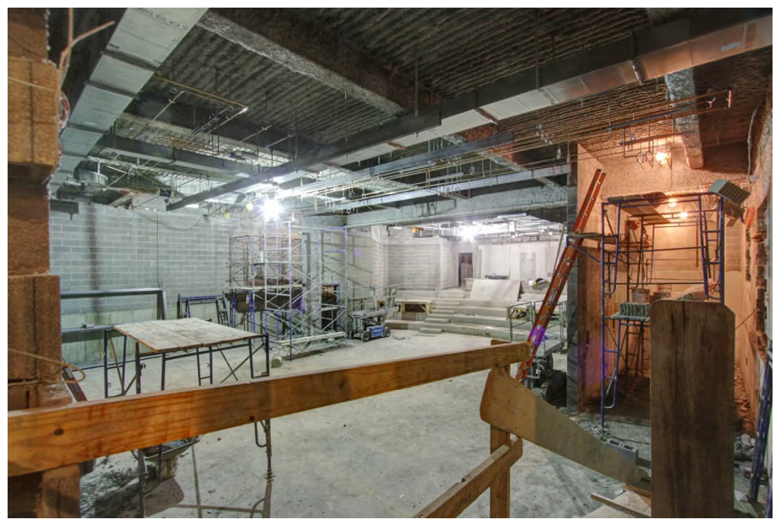
Masonry wing walls in the amphitheater and TV studio are being completed. Overhead mechanical/electrical work is ongoing.