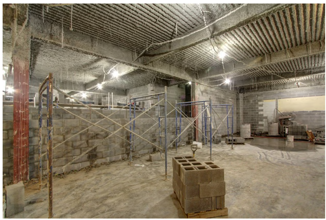
Masonry walls continue being built in the former boy's locker room. The two parallel walls being built in this photo form the corridor path to the new fitness/weight room in the former wrestling room.