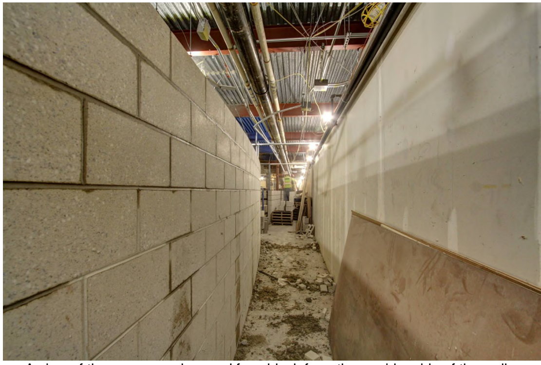
A view of the new curved ground face block from the corridor side of the walls. Tuesday, February 25, 2014