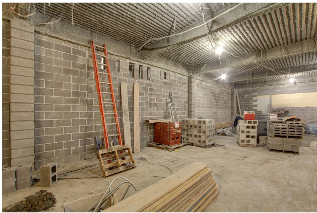
The masonry walls in the former boy's locker room are completed to the structure above. This wall is the east wall of the new social studies classrooms and one of the walls that forms the new hallway to the fitness/weight room.