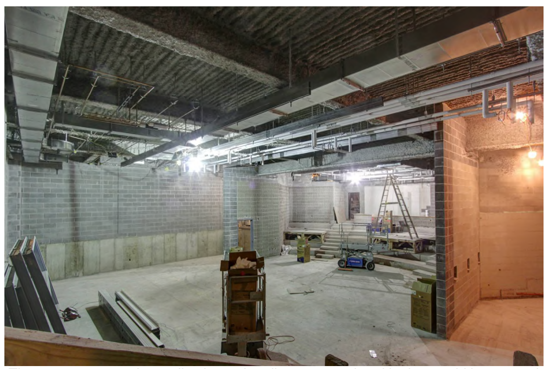
The new masonry wing walls pictured earlier are completed in the amphitheater and the new TV Studio.