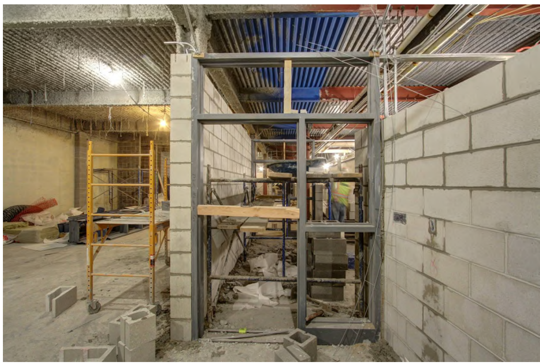
Standing inside one of the new social studies classrooms looking through the door, sidelights, and transom which will allow natural light from the corridor into the rooms.