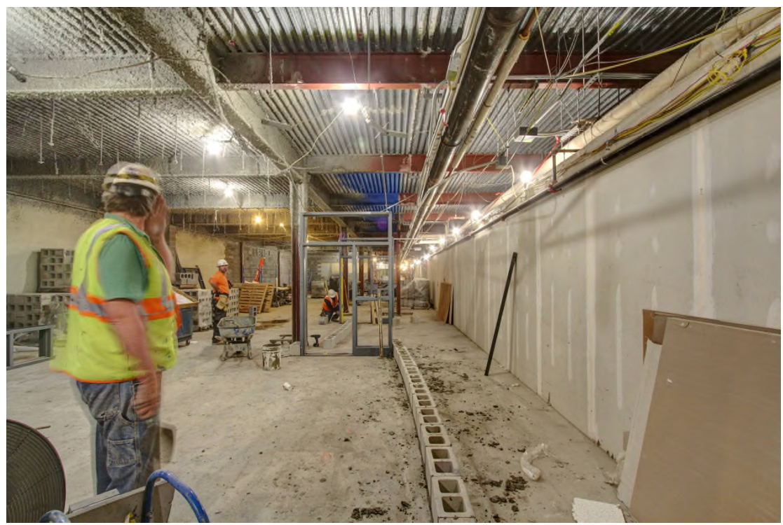
The curved masonry walls along the corridor at the 4 new social studies rooms are beginning to be laid out. At the far end of the wall is the entry door and its sidelight and transom light which will allow light from the light-well into these new rooms.