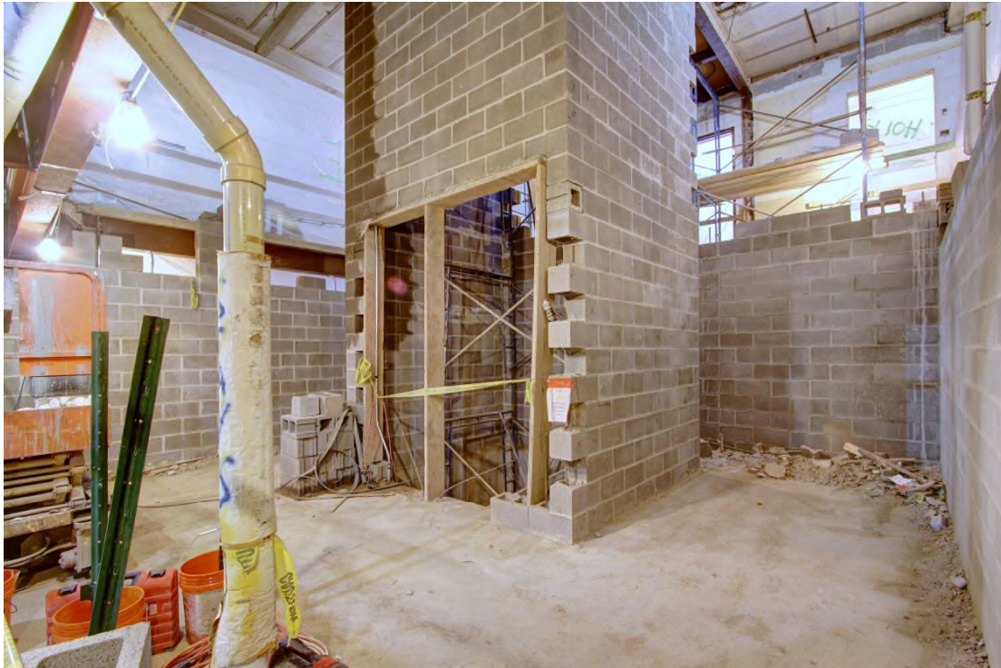
The new elevator shaft and stairwell walls in the former Upbeat area. The existing roof structure is being shored to allow cutting and the elevator shaft to continue through the roof.