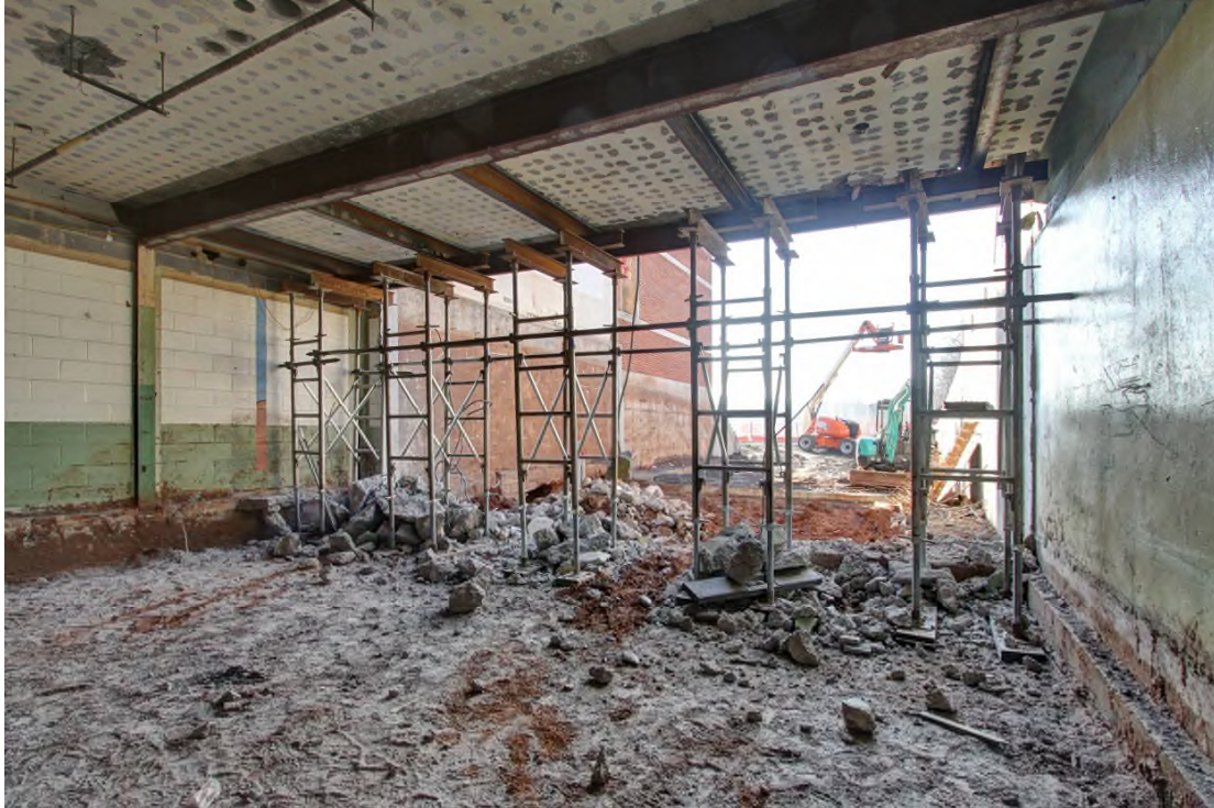
Inside view looking out from the old Upbeat area through the structural shoring and the rubble that used to form the south wall of the school in this area.