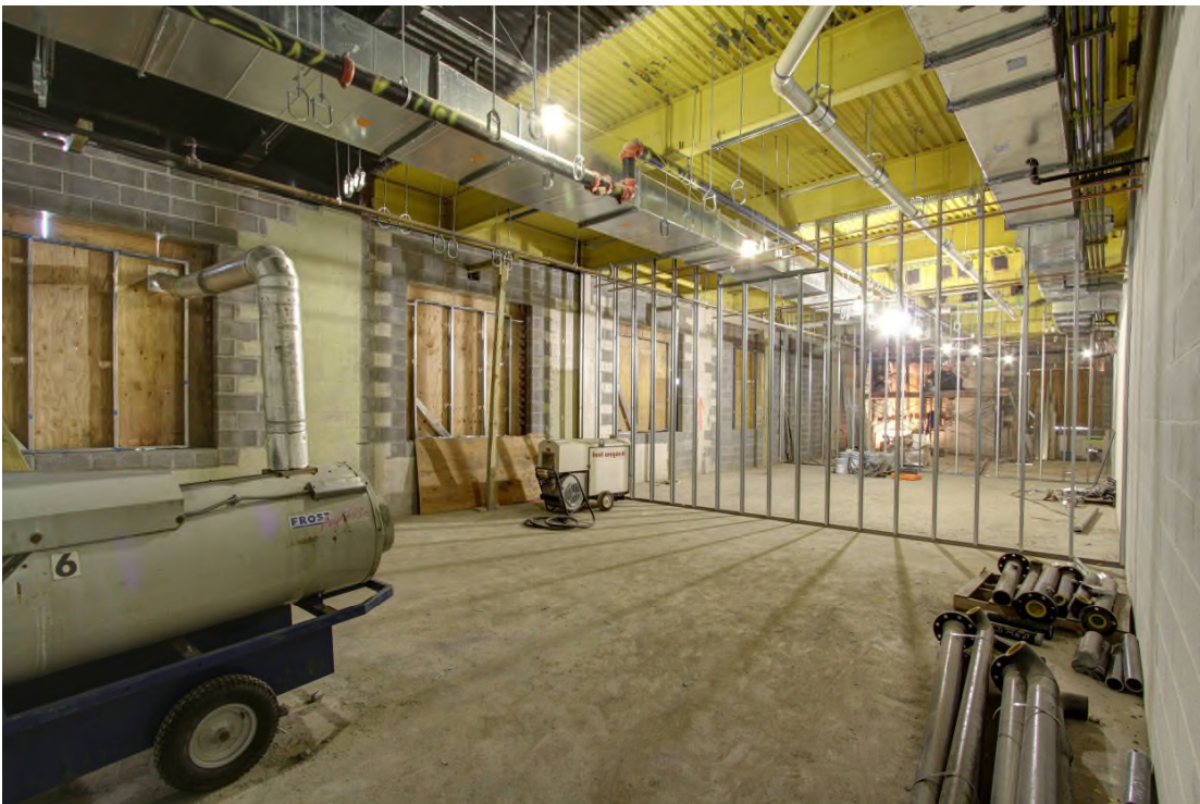
New window openings and classroom separator walls are shown here in what used to be the auto shop. The new Phase 1 addition is outside the plywood covered window openings on the left.