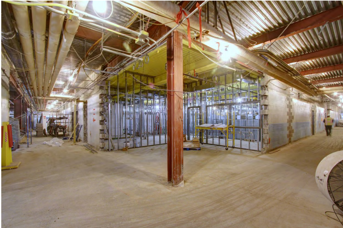
View of the future home of the school radio station. The corridor on the left runs to the east towards the student parking lot and the one on the right to the south towards the athletic fields.