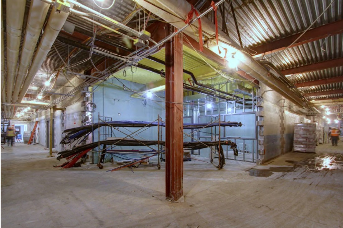
A view of the future Radio Station with drywall installed on the metal framed walls. Thursday, January 23, 2014