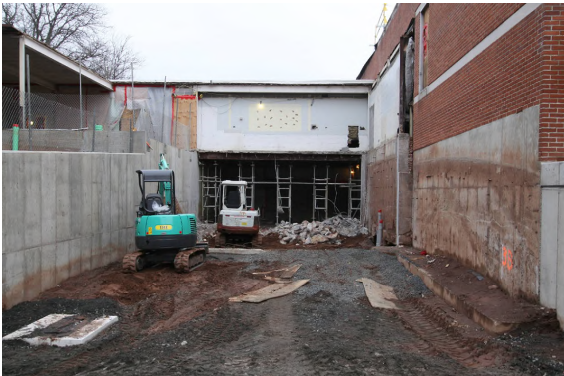
This view shows what used to be the south wall of the upbeat area demolished to make way for the new boiler/chiller room to extend south to beneath the wall of the science room above.