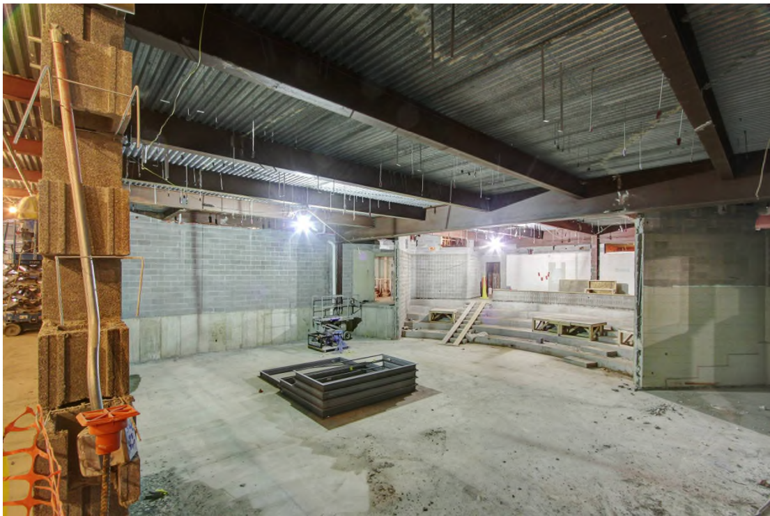
Looking down into what will be the home of the TV studio and across to the existing Amphitheater which will remain but be upgraded and modernized.