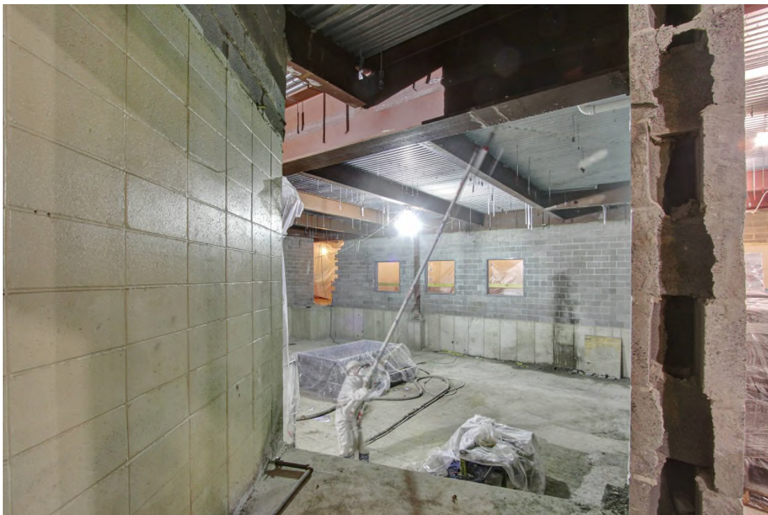
A worker applies spray fireproofing to the steel structure and metal deck over what will be the new TV Studio.