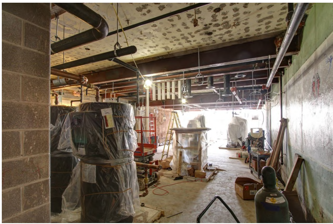
The new chiller room is loaded with equipment and piping work has begun. Friday, May 2, 2014