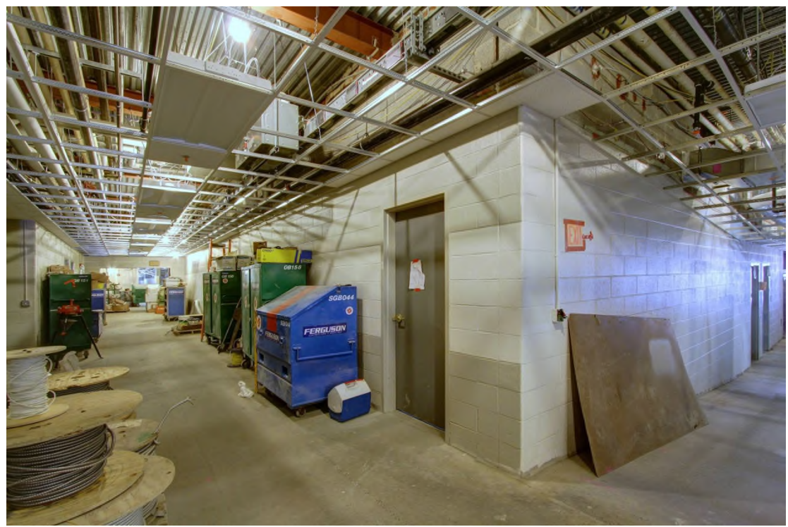
Ceiling grids are now installed in most hallways and floors are being prepped for tile. Tuesday, May 6, 2014