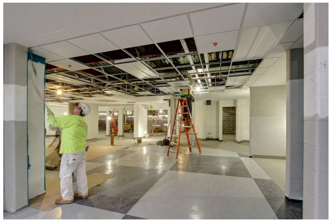
The new floor tile running from the cafeteria into the servery ends when it meets the quarry tile under the new serving line.