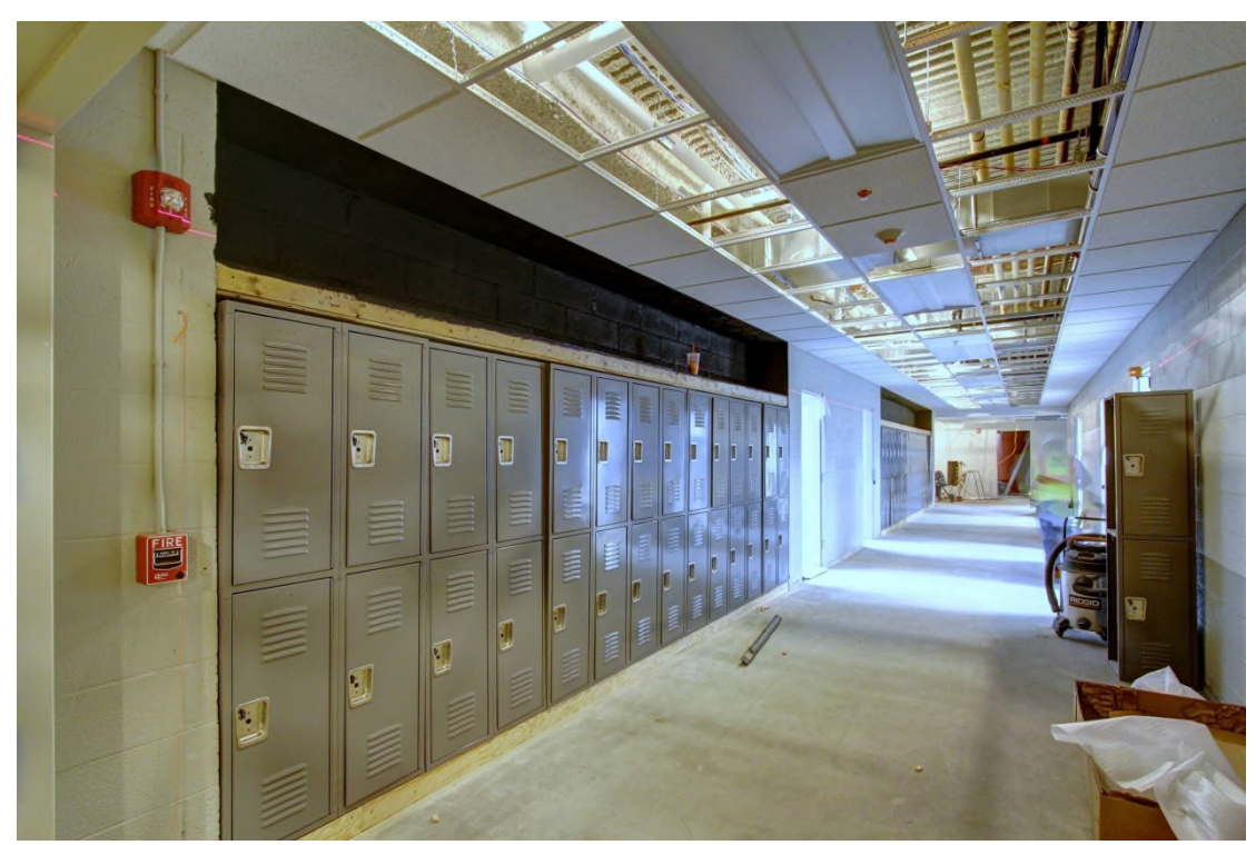
This hallway runs past the business classrooms and special education area and back towards the new elevator and stairs in the former Upbeat area.