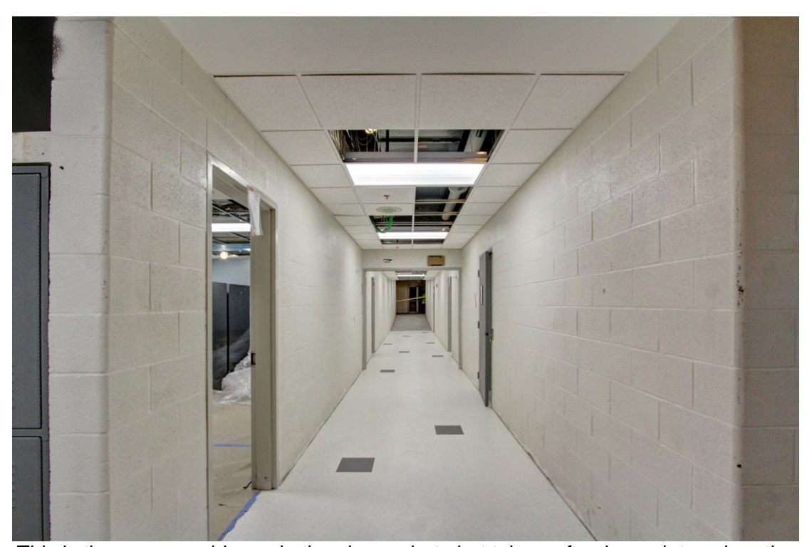
This is the same corridor as in the above photo but taken a few hours later when the floor tile had been installed..