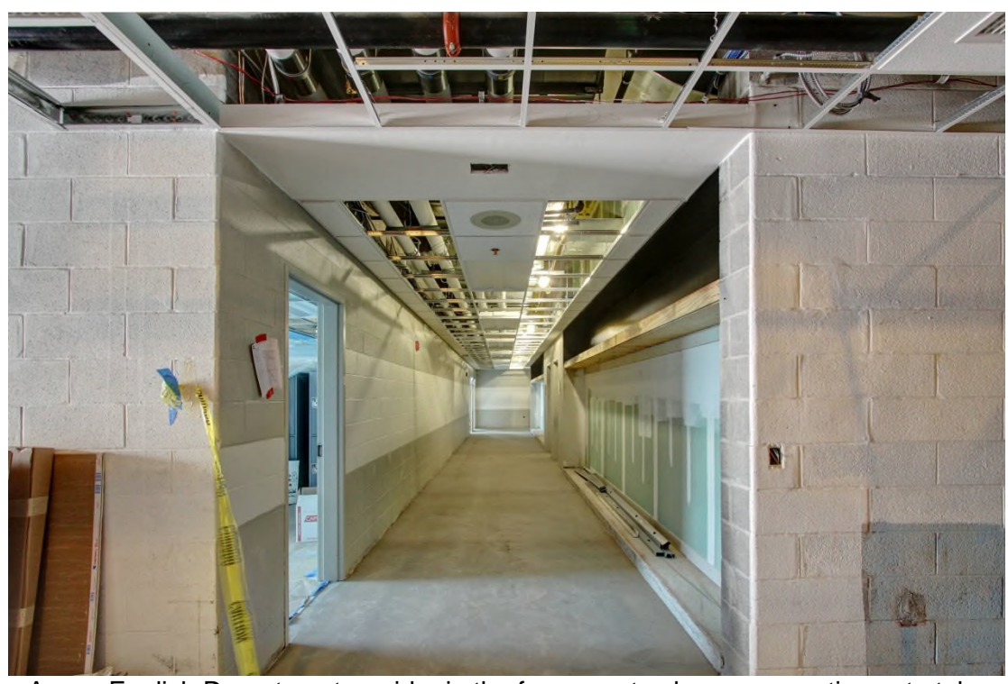
A new English Department corridor in the former auto shop area continues to take shape with floor prep finished so that floor tile can be installed.