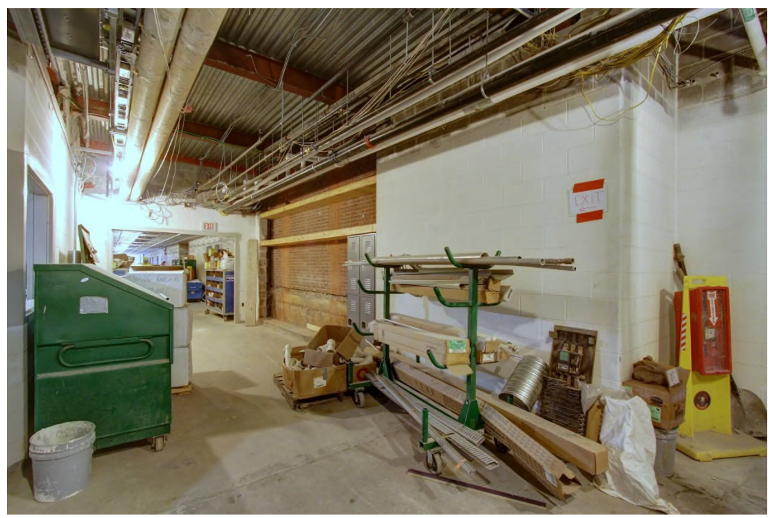
Brick from the old 50's building can be seen in this hallway in a locker alcove. Tuesday, May 6, 2014