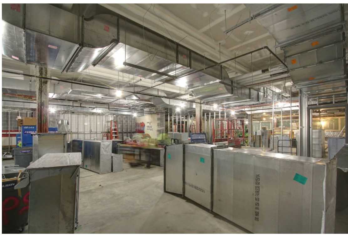
Overhead mechanical and electrical systems and new wall framing continues in what will be the new Family & Consumer Science area.