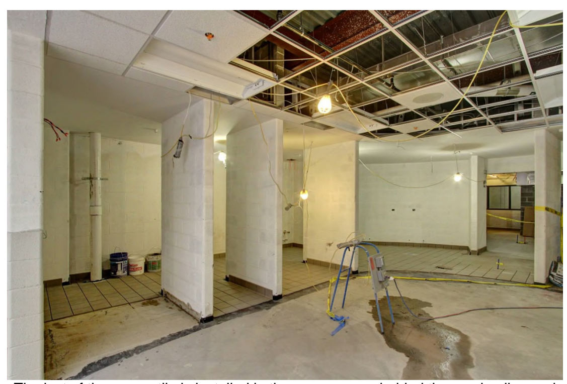
The last of the quarry tile is installed in the servery area behind the serving line and final prep is being done on the tile area in front of the serving line.