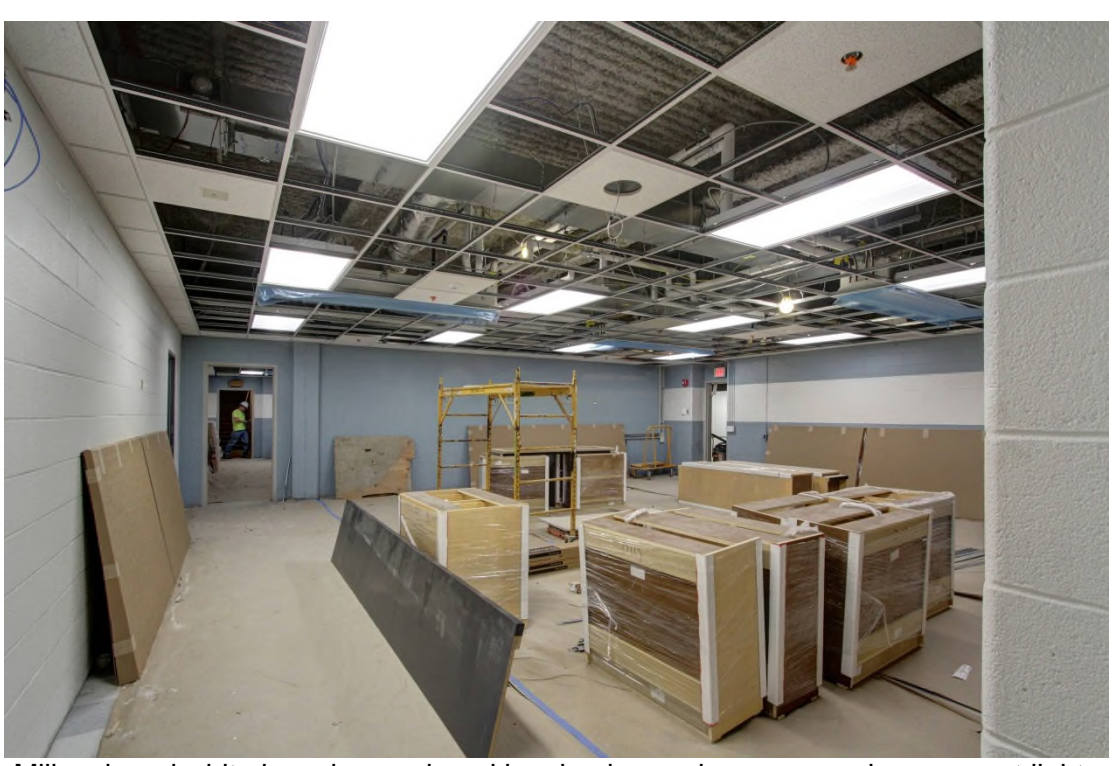
Millwork and white boards are placed in a business classroom and permanent lights are now on in most areas of the renovation.