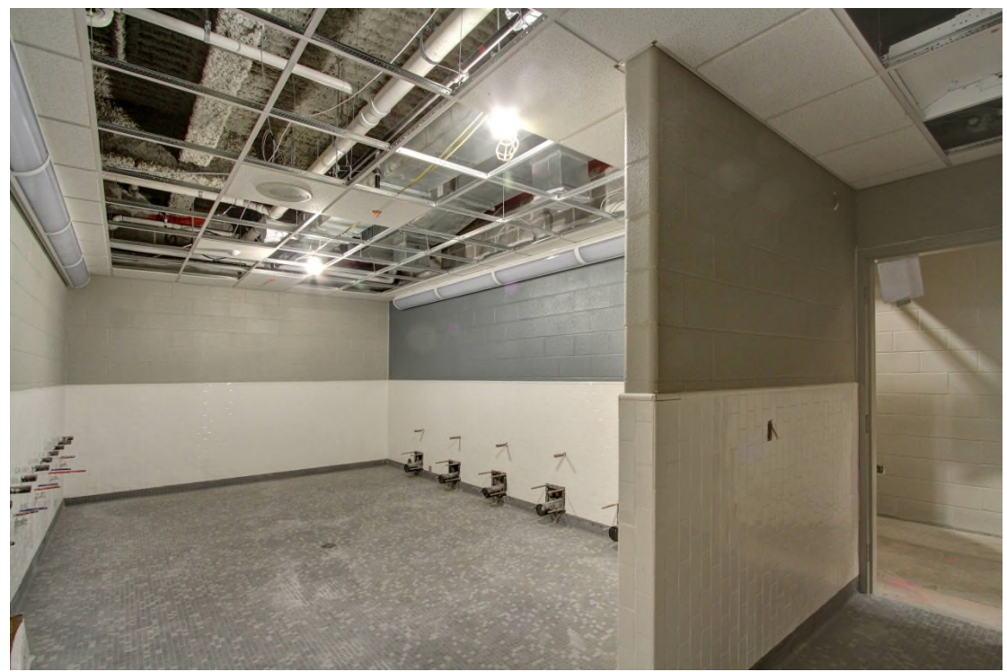
Tile and paint are substantially complete in a new bathroom. Fixtures and toilet partitions will be installed over the next few weeks.