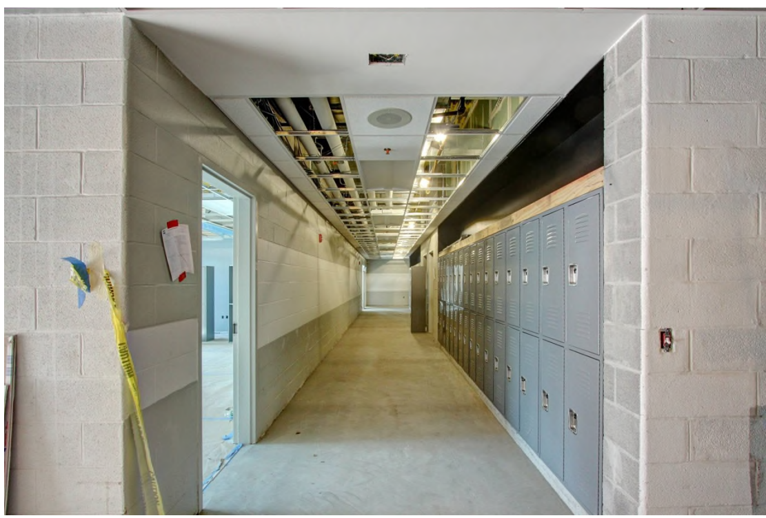
Lockers are installed in the English area which used to be the former Auto Shop. Tuesday, May 6, 2014