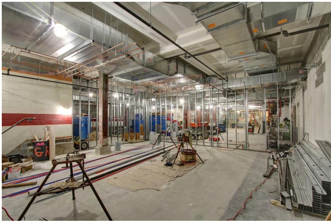
Overhead mechanical, plumbing, and electrical work continues in a health classroom adjacent to the F&CS area under the main gym.