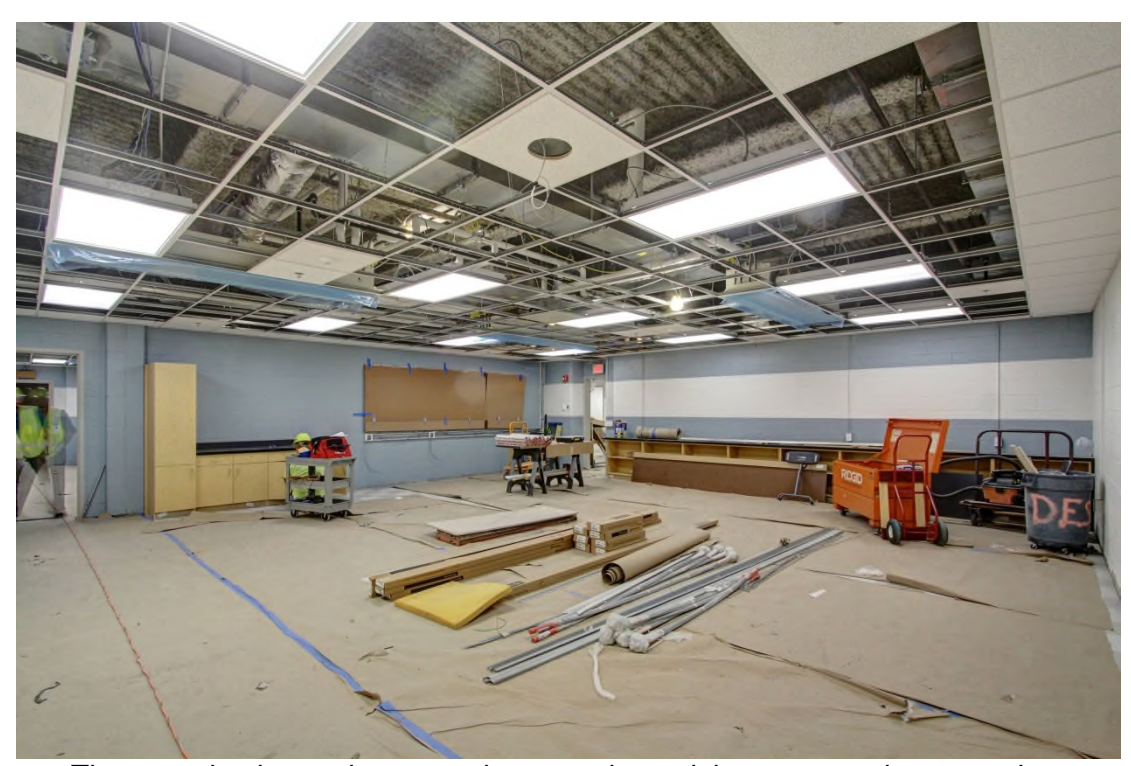
The same business classroom that was pictured three pages above now has millwork installed and a white board on the wall.