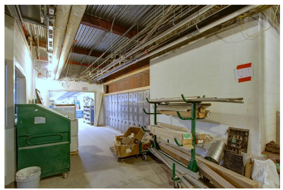
To show the pace of the work, this is the same photo as above but 20 minutes later. At this point, all of the lockers are installed in the alcove.