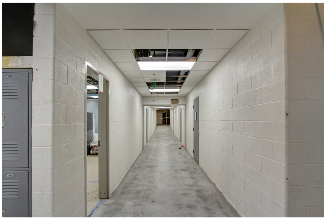
This view is looking north up a new corridor and ramp through the new Art Classroom area and towards the F&CS area.